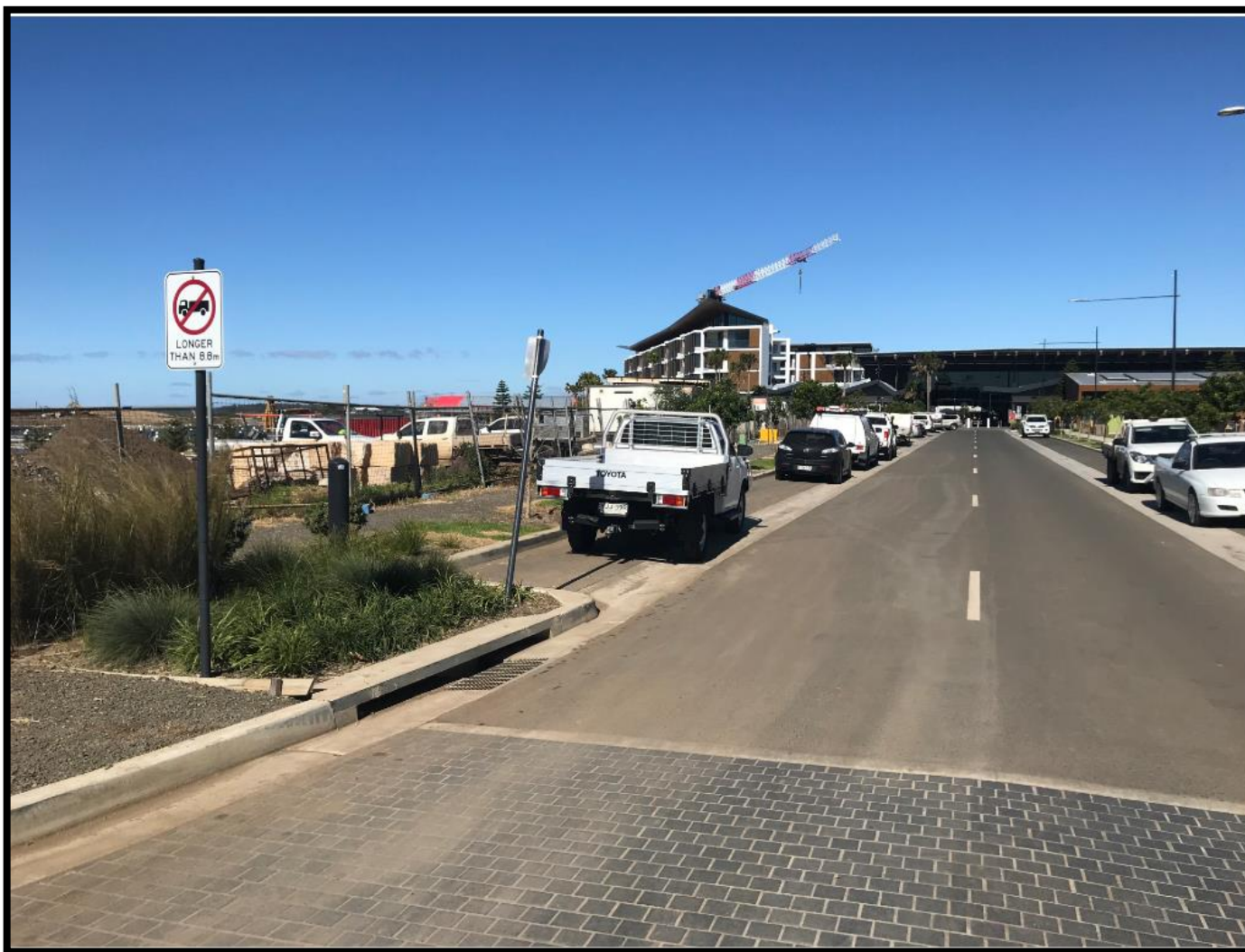
Figure 3.8 – Photo taken from Waterfront Promenade looking south towards Precinct D (brown arrow on figure 3.1 )