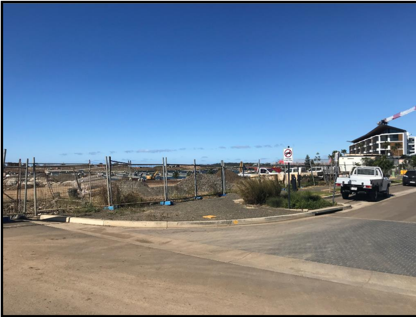
Figure 3.9 – Photo taken from Aquatic Drive looking south (pink arrow on figure 3.1 )