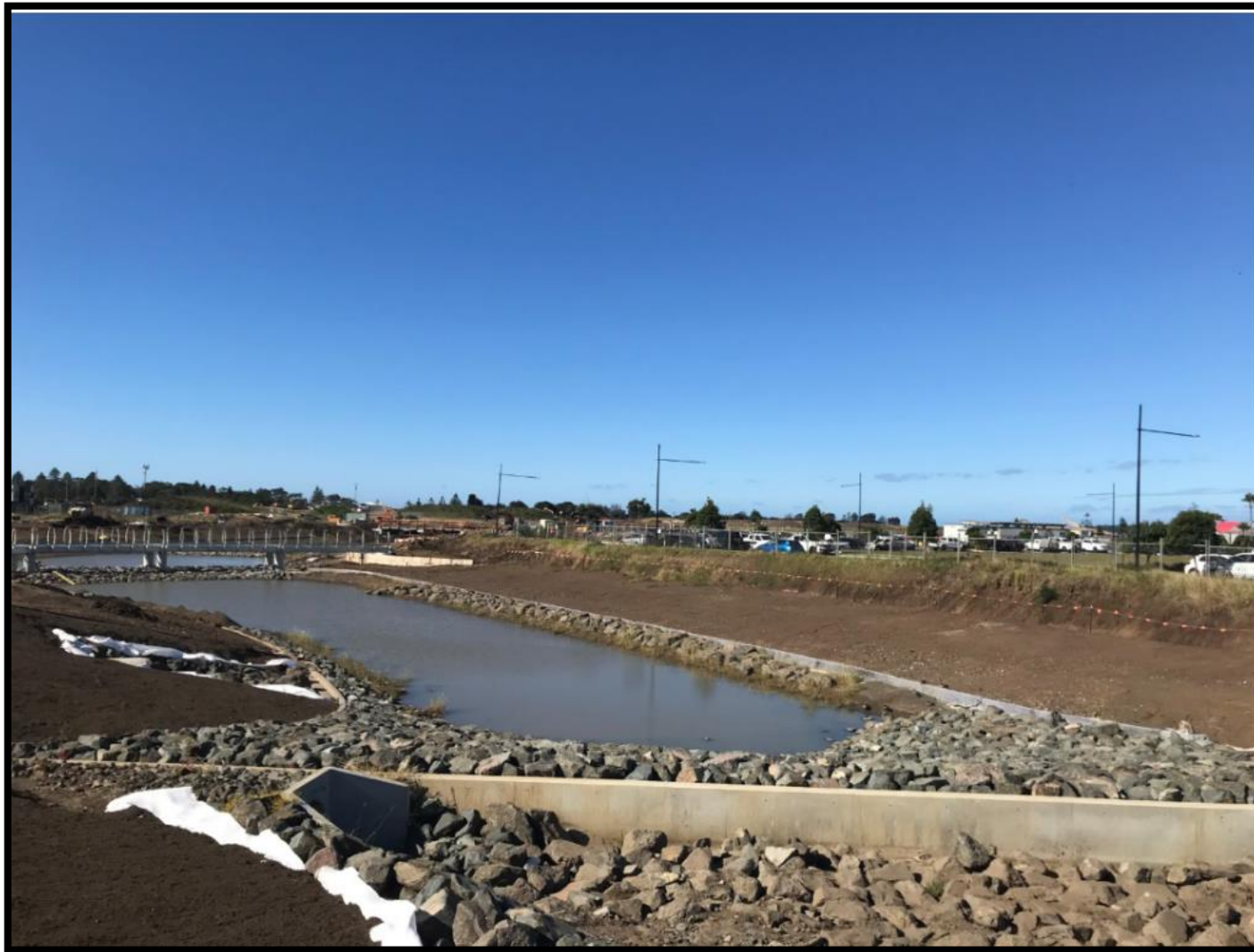
Figure 3.2 – Photo taken from Harbour Boulevard looking east towards application site (black arrow on figure 3.1 )