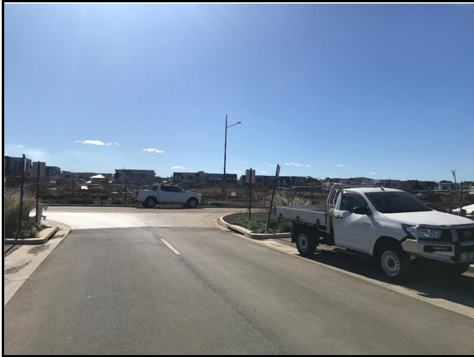
Figure 3.6 – Photo taken from Waterfront Promenade looking north (blue arrow on figure 3.1 )