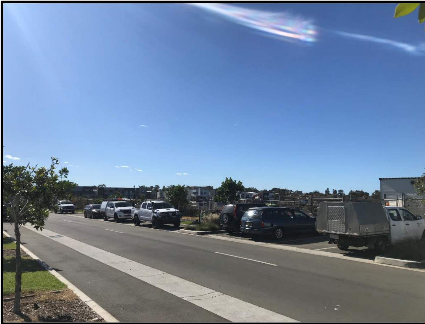
Figure 3.4 – Photo taken from Waterfront Promenade looking north towards application site (orange arrow on figure 3.1 )