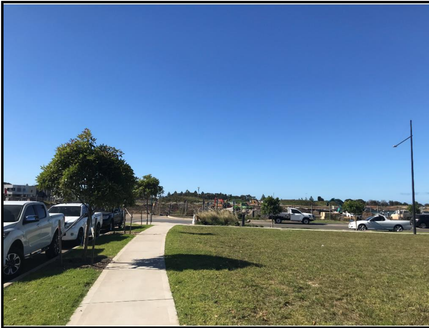
Figure 3.3 – Photo taken from corner of Aquatic Drive and Harbour Boulevard looking east towards application site (red arrow on figure 3.1 )