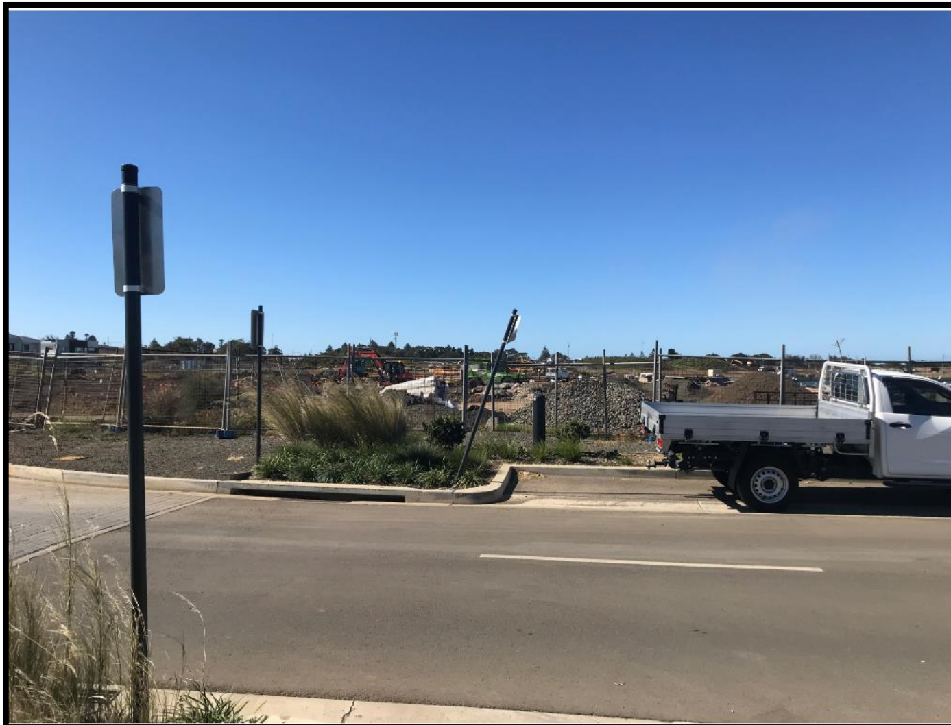
Figure 3.7 – Photo taken from Waterfront Promenade looking east towards application site (purple arrow on figure 3.1 )