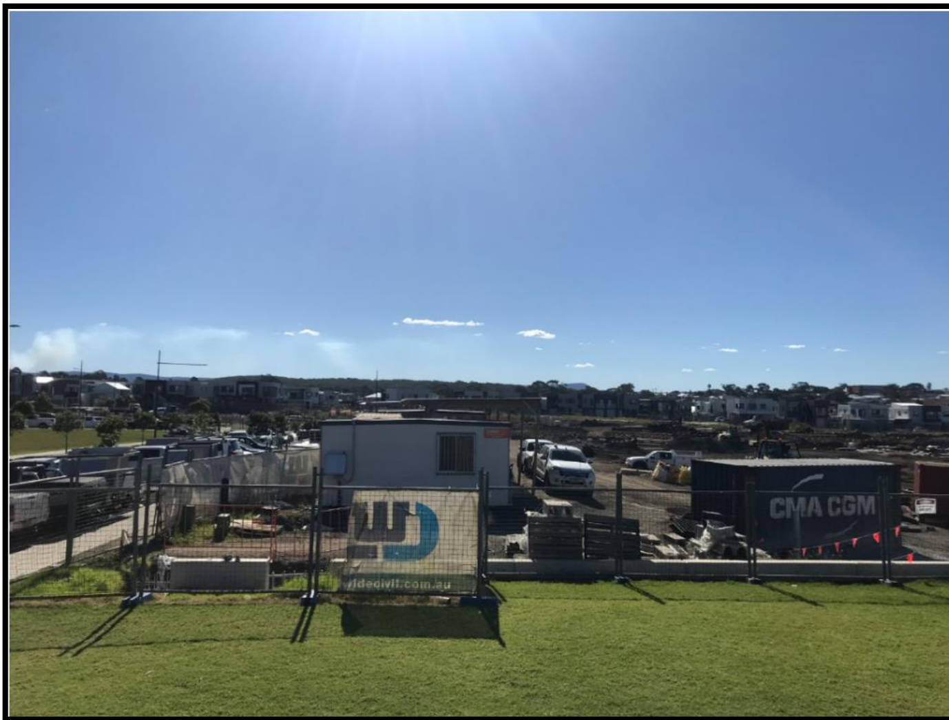
Figure 3.5 – Photo taken from viewing platform looking north towards application site (green arrow on figure 3.1 )